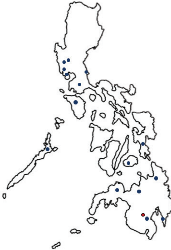
Figure 3. Distribution of P. rumphii Blume in the Philippines with new distribution in Columbio, Sultan Kudarat (●), Salvaña et al. (2018).