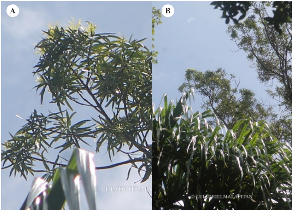
Figure 2. A, Closer shot of species P. rumphii Blume in Columbio, Sultan Kudarat; B, wide shot of P. rumphii Blume in Columbio, Sultan Kudarat. (image: Lui Adriel Malapitan).