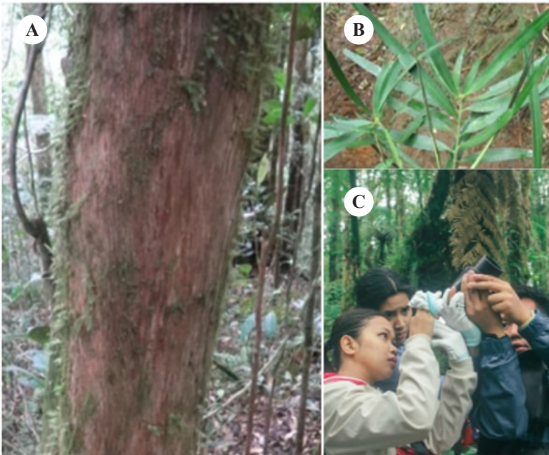
Figure 4. A, Tree bark of P. rumphii Blume; B, collected leaves; C, research team during the conduct.