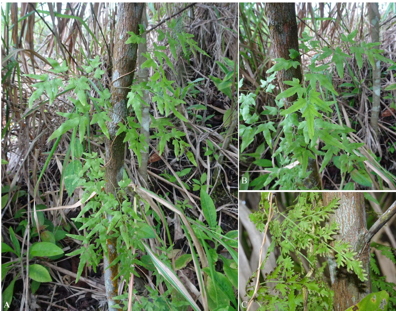
Figure 1. Lygodium japonicum (Thunb.) Sw.. a. habit; b. lamina; c. fertile lamina showing the sori.

A comprehensive review of published literature regarding the morphology, ecology, reproductive biology and economic uses of L. japonicum (Thunb.) Sw. (Fig. 1) were evaluated and synthesized to assess its invasion among various ecosystems. Reputable scientific journals and databases such as Centre for Agriculture and Bioscience International (CABI), International Union for Conservation of Nature (IUCN) and Global Invasive Species Database (GISD) served as the main source of information for the invasive tendencies of L. japonicum (Thunb.) Sw. and management measures employed to control such invasive species. Online references and materials were accessed using structured keyword