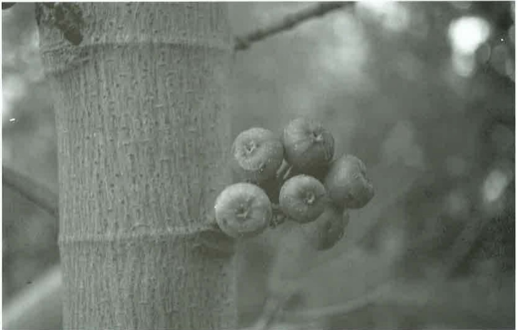
Figure 4 Photograph on figs branch of Ficus hispida L.f. var. hispida