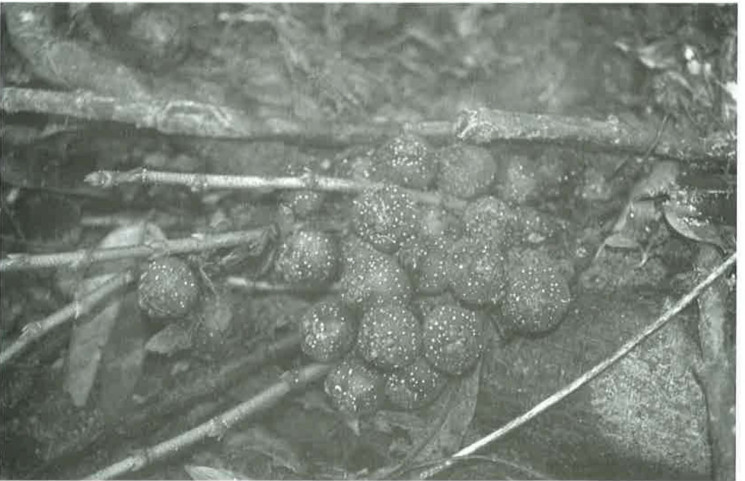
Figure 6 Photograph on figs branch of Ficus hispida L.f. var. badiostrigosa Corner