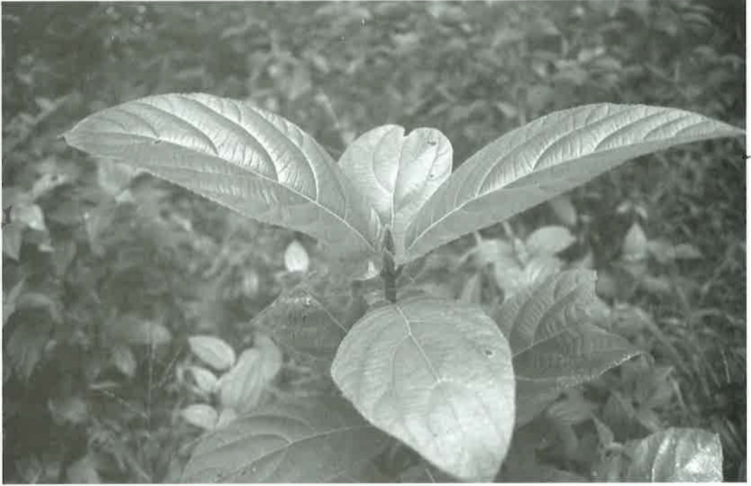
Figure 3 Photograph on leafy branch of Ficus hispida L.f. var. hispida