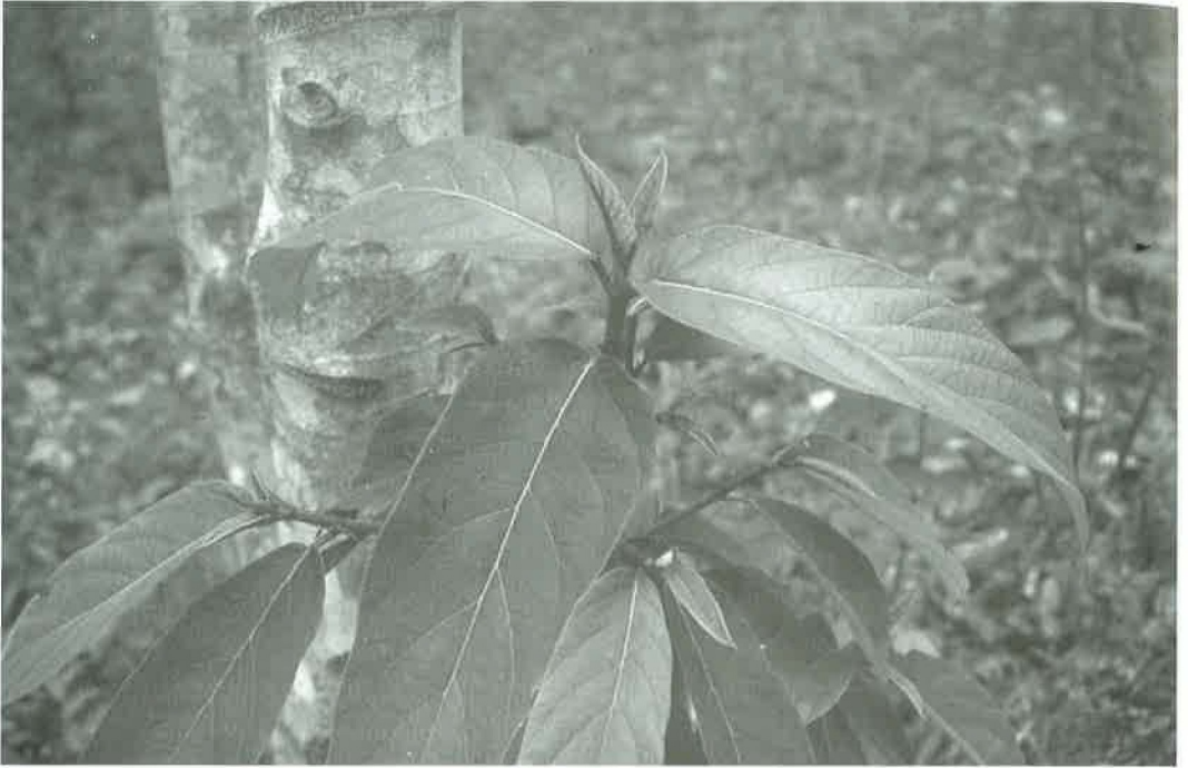
Figure 5 Photograph on leafy branch of Ficus hispida L.f. var. badiostrigosa Corner